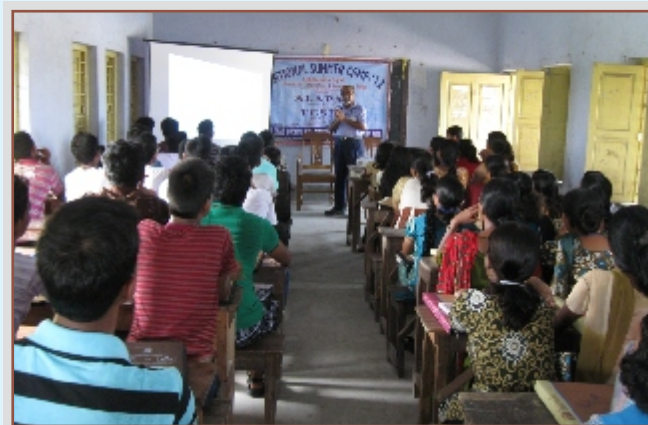
Awareness Session on summer camp

Coaching classes to girls for class 8th entrance exams in Jawahar Navodaya Vidyalayas began this quarter. Regular coaching classes have also been started for the STD 9th, 10th and 11th with special emphasis on personality development.