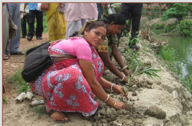
Celebration of world environment day

On the occasion of World Environment month, TCSR along with the youth club of Borda village organized cultural program related to preservation of environment for the villagers. A rally of the school children was also held to mark World Environment Day. Vigyan Manch helped in organizing this rally, where school children walked through villages holding the banners and posters with "save our planet" quotes written on them. The Block Development Officer and members of the political groups along with villagers participated in the rally and planted saplings in their village.