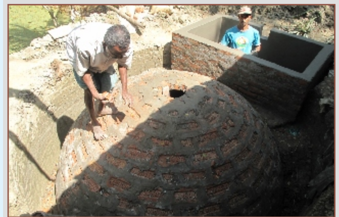
Bio gas at Haldia

Energy efficient cooking stoves and bio gas plant 60 energy efficient cooking stoves (chulhas) and 2 bio-gas plants were constructed at Haldia. Both of them has helped in decreasing the dependency on fuel wood to a great extent and at the same time has decreased the health problems associated with burning of fuels for cooking. 7 energy efficient smokeless cooking stoves (chulhas) designed by Indian Institute of Science (IISc) Bangalore for personal use were constructed in 3 villages and one chulha for commercial purpose was constructed in township of Babrala.