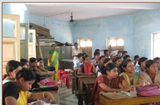
Training on Nursing and Hospitality

Various trades like tailoring, nursing and hospitality, electrical repairing, computer application and mobile repairing for the rural youth and women were undertaken at Haldia. The training is being organized at Jan Shikshan Sansthan under the aegis of adult literacy program.