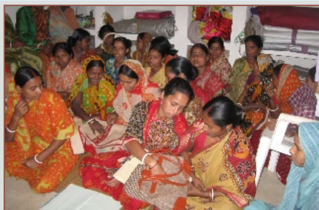
Training on jute handicrafts

The other program which has helped women to raise their family income is jute craft group enterprise. Women of jute craft have began to produce jute bags for corporate bodies and local market.