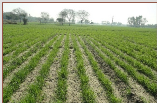
Inter cropping Wheat+Mentha

Diversification of crops has been promoted in all the three location to sustain natural resources. At Babrala, during this quarter, 12 acres of Mentha crop was sown by 8 farmers in 6 villages of core command area.