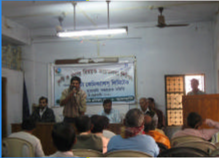
President (Sutahata Panchayat Samiti) inaugurating the session

The objective of the program is to help farmers increase their crop productivity.