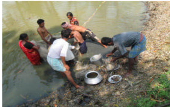
Sale of fishes directly from the pond

ket linkage. The women are now not only practicing fish culture for household consumption but some members have also taken ponds on lease to produce fishes on a commercial scale.