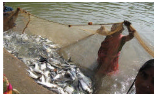
Netting of fishes in pond at Nachhimpur

The host SHG enlightened the participants about