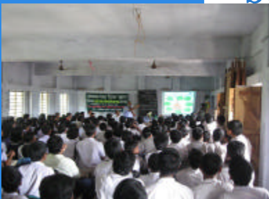
SHE session at Joynagar High School

A feed back session was also organized after completion of the program.