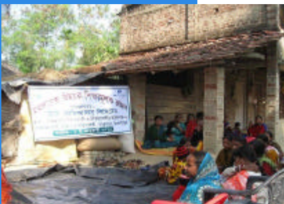
Meeting of SHG members of Akubpur and Nachhimpur

Pond Management program has provided the rural households with a n improved source of income