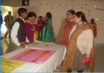
Inter school Science exhibition by rural schools

In order to increase social interaction with the nearby community, a variety of cultural & educational programs for the rural community, are held as a part of the Founder's day (Jamsethji Tata's Birth anniversary) celebrations.