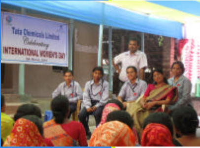
Volunteers with the women of Akubpur

In the two hour session, the women actively voiced their opinions and expressed the necessity of participating in similar programs together with their spouses. They enjoyed the discussions and voiced feeling empowered, respected and loved.