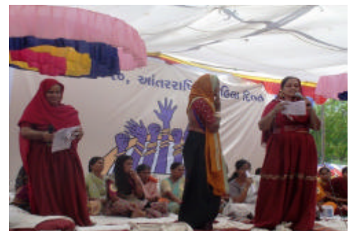
International Women's Day Celebration— Okhamandal

The objective of the program was to demonstrate the spirit of women and womanhood. They showcased their success of establishing self-help groups, supporting their families finan-