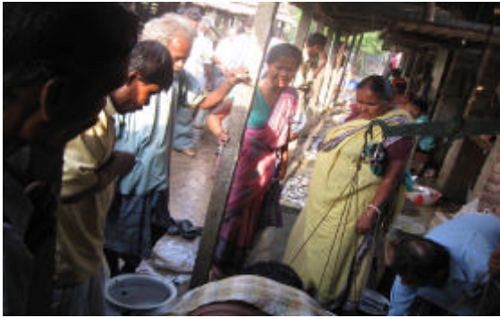
Sale of fishes at Chainyapur Wholesale Market

Under the Pond Management Project, Self Help Group members have started selling fishes in the local market. It is estimated that till now they have sold approx. 250 kilograms of fish from their ponds.