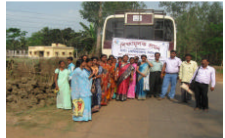
Samriddhi members during the exposure visit

This NGO is engaged in production of mattress, ladies purse, gents wallet, bed sheets, wall hangings etc. Apart from learning about productions, the members learnt about group dynamics, decentralization of work and market linkages of the products.