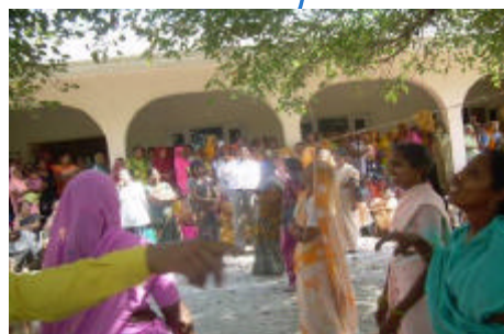
Fun & Games at Babrara

TCSR Babrara celebrated the International women's day together with the rural women and the ladies of the Tata Chemi-